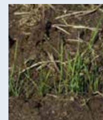
Annual Rye grass