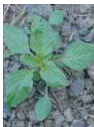
Broad leaved weeds

KEEP LOCKED AND OUT OF REACH OF CHILDREN (WEKA MBALI NA WATOTO),